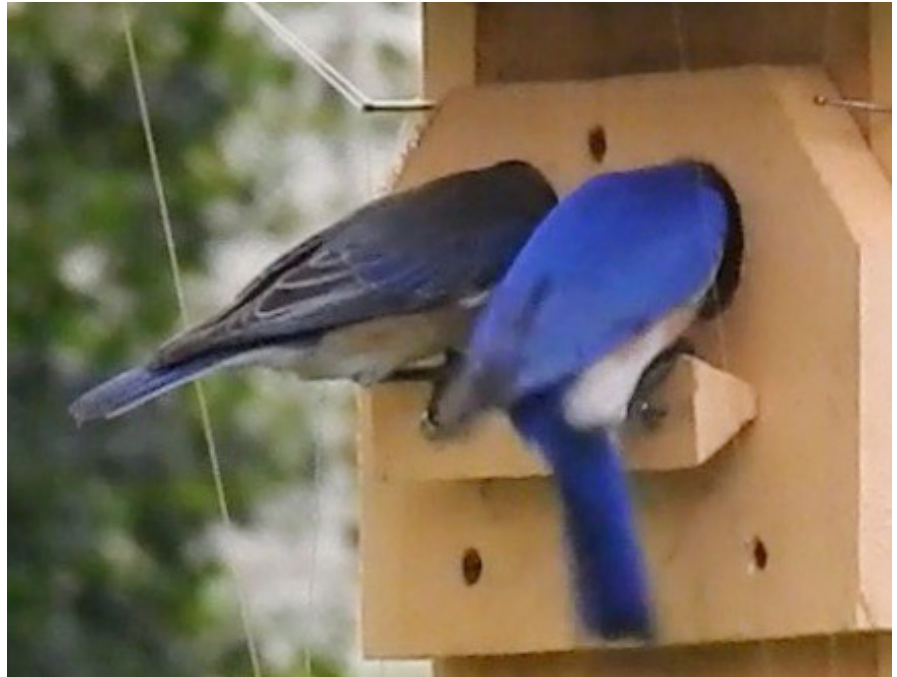
Bluebirds nesting in Grant St backyard