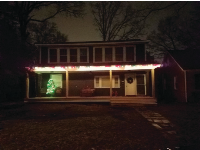
The Most Festive – Two winners – 2900 Condie Street and 3112 Bute Lane