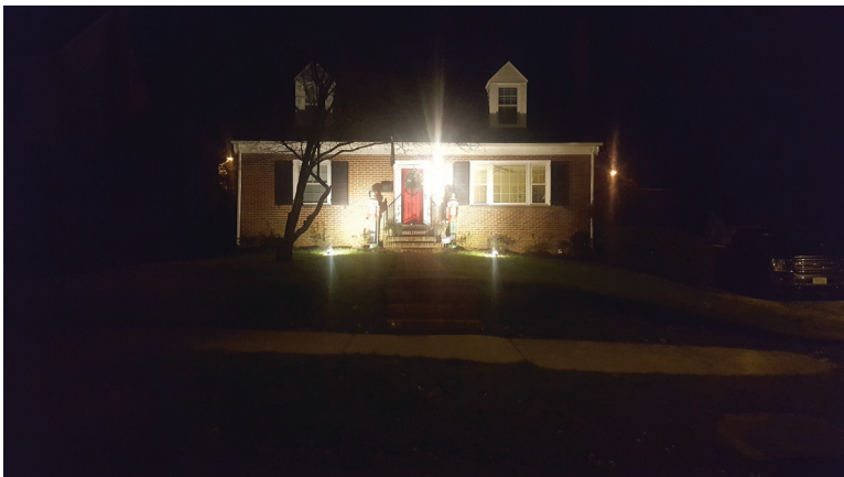
The Most Original - 3121 Rendale Ave