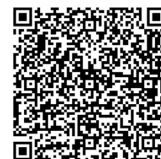
The Arts Fuse